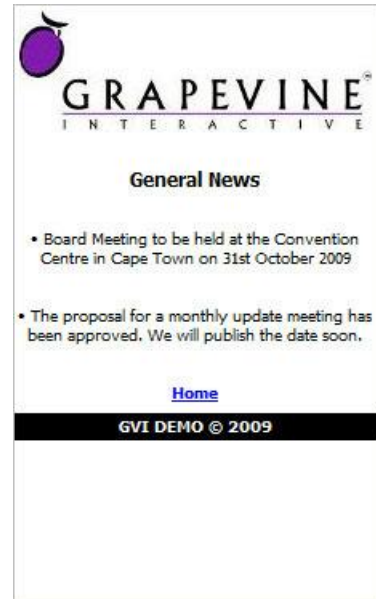
Sample WAP site

Note: The tags used above are examples only. Your WAP site may use different tags.