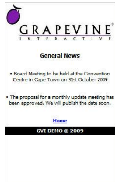
Sample WAP site

To edit your XML file, you will need to understand what each XML tag means.